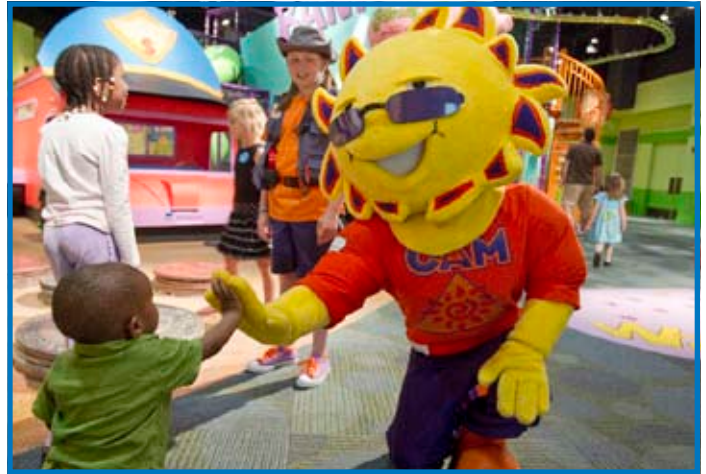
CAM and Clair have fun with friends at a local event.

The Clair and CAM mascot program is a unique air quality education program that focuses on young children ages 4-8. Clair and CAM encourage students and parents to reduce air pollution by saving electricity, not idling, and driving less. Reducing vehicle miles traveled, or VMTs, can quickly translate into better air quality for everyone. The program also empowers children to make a difference by changing their habits, and those of their parents, friends and neighbors. By searching for “Clean Air Clues,” Clair and CAM work to tackle two of North Carolina’s biggest air quality problems: ground-level ozone and